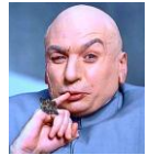
"we shall call him..... number 2"